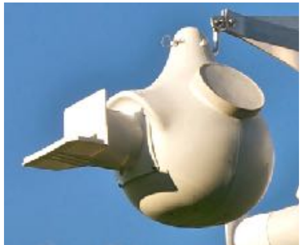
SuperGourd Mounted on to a "Horizontal" Gourd Mounting Arm.

Remember to add several handfuls of pine needles or like for bedding.