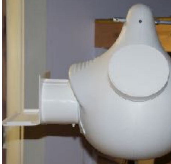
SuperGourd on a "Horizontal" style gourd hanging arm.

Step 13) The last step is to drill your SuperGourd so that it hangs front to back. Once you choose your spot, drill the \frac{3}{8} " hanging hole ( \frac{3}{8} " is used when hanging your gourd onto the gourd arms of the Deluxe style gourd rack, or our Gourd Mounting Arms)