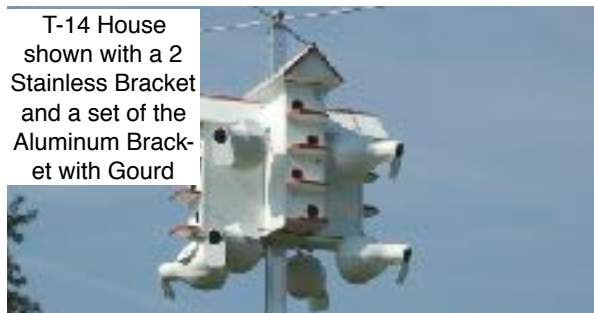
T-14 House shown with a 2 Stainless Bracket and a set of the Aluminum Bracket with Gourd

Step 6) Slide the gourd thru the gourd arm till it hits the stop. Place your hitch pin (B) into the pre drilled hole in the gourd arm. This will keep your gourd in place.